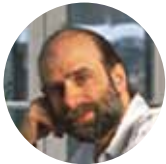
Bruce Schneier Inrupt, Inc. Chief of Security Architecture Twitter: @schneierblog LinkedIn: N/A