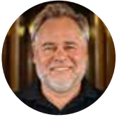
Eugene Kaspersky Kaspersky CEO Twitter: @e_kaspersky LinkedIn: Click Here